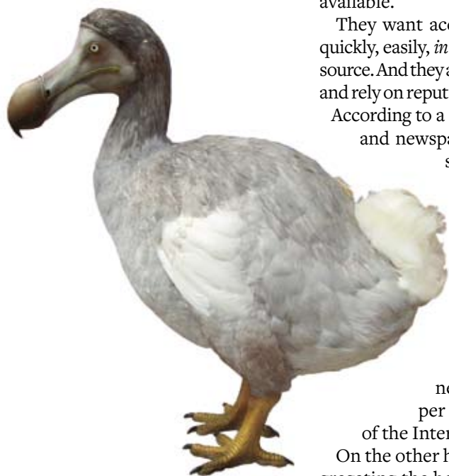
THE DODO BIRD: AN EXTINCT FLIGHTLESS BIRD OF MAURITIUS, LAST SEEN IN THE LATE 17TH CENTURY.

On the other hand, if newspapers start aggregating the best local blogs and websites covering a wide variety of subjects, they will provide their time-starved readers with the ultimate customer service: They will save readers time, give them valuable information from trusted sources pre-approved by their trusted local newspaper, and make them both better informed and happy.